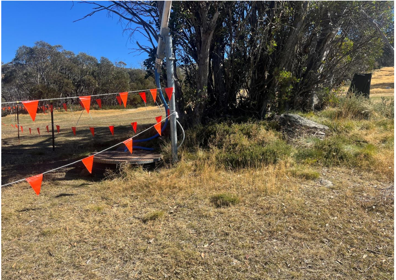
Photo 3: The proposed fan gun at the bottom of the cruiser area will be located such that there will be no need to clear any of the small tree island immediately above.