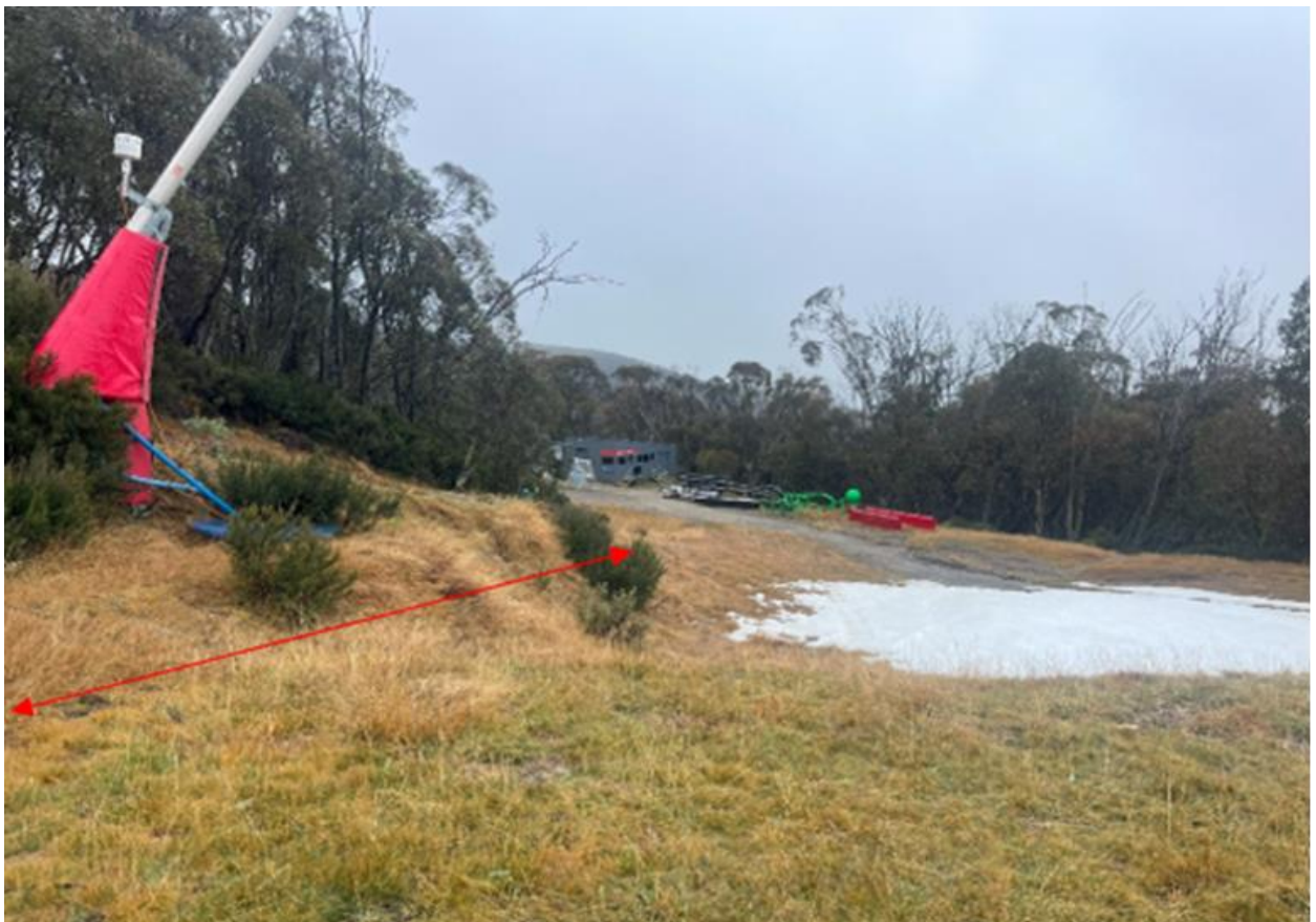
Photo 6: The slope cut below earth mound 2 will impact these shrubs on the adjacent batter.