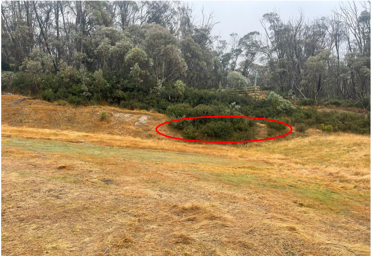
Photo 5: The slope cut and movement of mound 2 may require the removal of these regrowth shrubs on the adjacent batter.