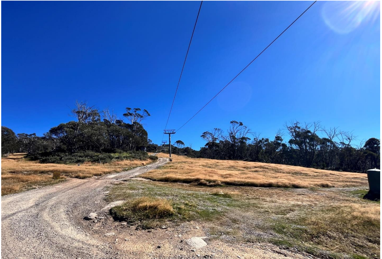
Photo 1: The proposed upgrades will be entirely contained within the existing heavily disturbed ski slopes.