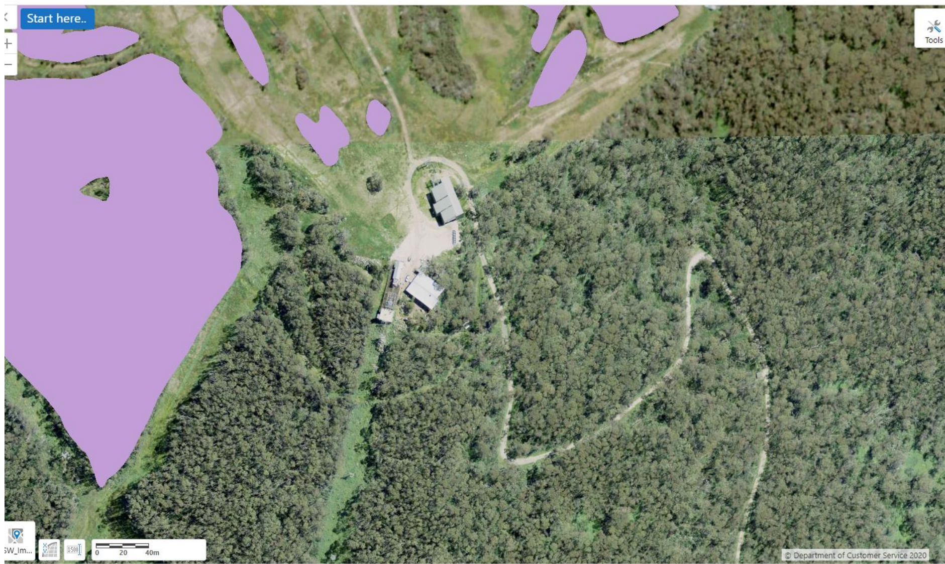
Figure 2: The proposed works will not affect any vegetation on the Biodiversity Values Map.