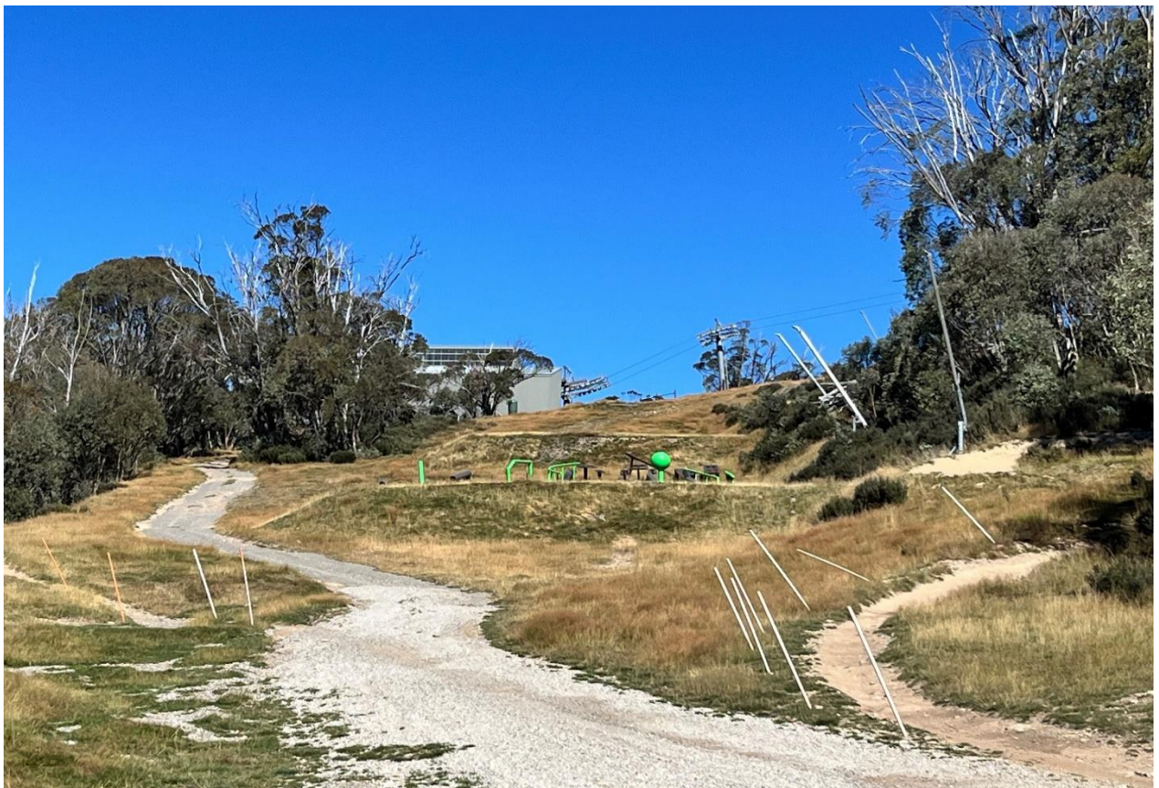
Photo 4: The existing earth mounds within the terrain park will be added to and mound 2 will be moved slightly uphill. Impacts on native vegetation will be limited to some shrubs on the adjacent batter.